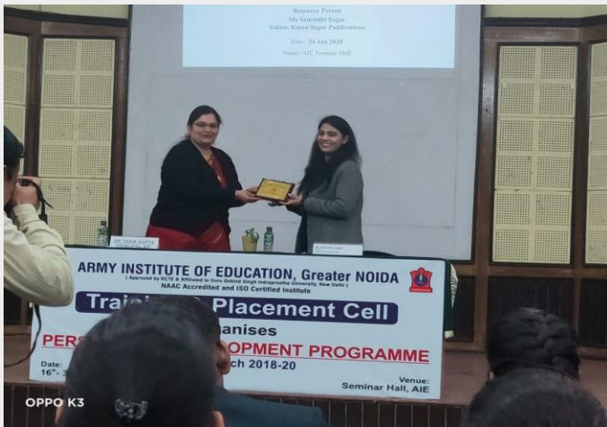
Felicitation of the guest

In continuation, with the help of some videos she enlightened students on the effective use of words in communication which can create an impact on people. Moreover, she gave some tips to the student-teachers to enhance their writing skills such as coordination of HEAD, HEART AND HAND, TPS (Think, Pair, Share), OREO (Opportunity, Reasons, Explanation, Organisation).