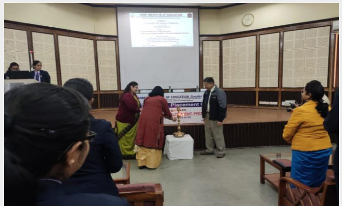
Lamp Lighting Ceremony and inauguration