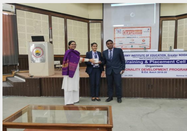
Student-teachers getting prizes