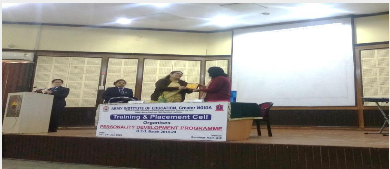
Felicitation of the Resource person by Principal AIE

She started the session by introducing theoretical aspect by ERIC BERNE. She introduced various terms like Johari Window, and how these techniques help people understand their relationship with themselves and others in a better way. Also, she introduced various other approaches that help in transactional analysis. She laid emphasis on transaction as the fundamental unit of social intercourse. Thereafter, she distributed questionnaires to student-teachers and asked them to score themselves on the questions given according to their self-reflection. The activity was fun, interesting and very productive, and it focused on the different types of ego states individuals have and realization of the dominant ego state in an individual. Subsequently, a healthy discussion took place, during which the student - teachers shared their responses. The session was very interactive and fruitful.